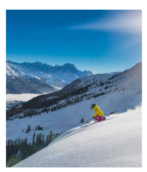
Skiing, St. Moritz