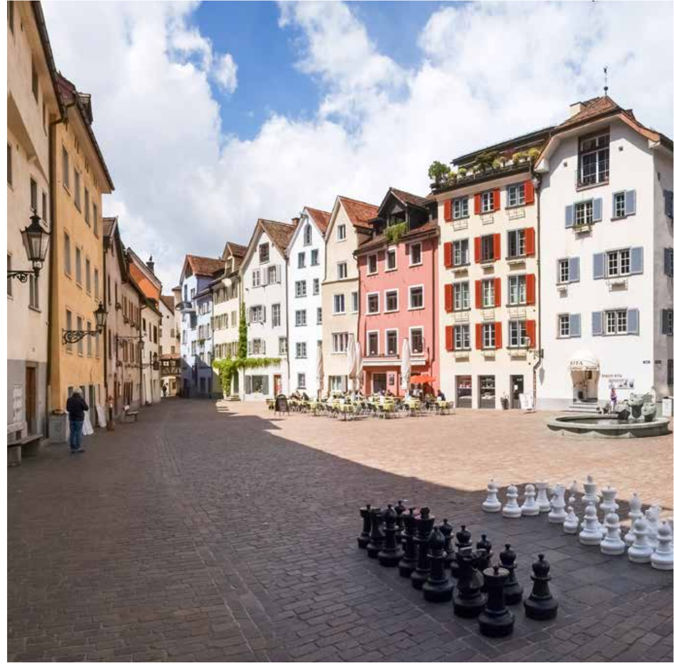
Old Town, Chur