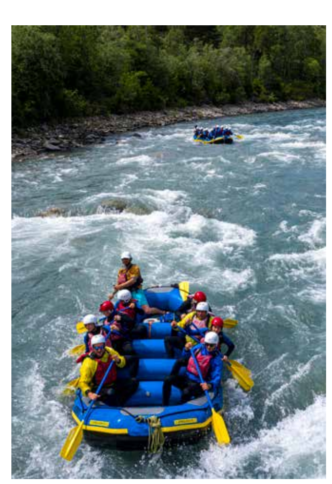
River Rafting, Rhine Gorge