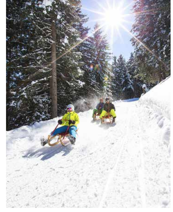
Toboggan run, Pizol

Tobogganing is a classic winter activity and remains unbeaten in terms of fun. There are various sledge runs for both beginners and experienced tobogganers in the immediate vicinity: on the Pizol, on the Flumserberg and in the Fideriser Heuberge, where the longest toboggan run in Switzerland promises a true adventure. The Pizol valley station is 10 minutes away by car; Flumserberg and Fideriser Heuberge are a 30-minute drive away.