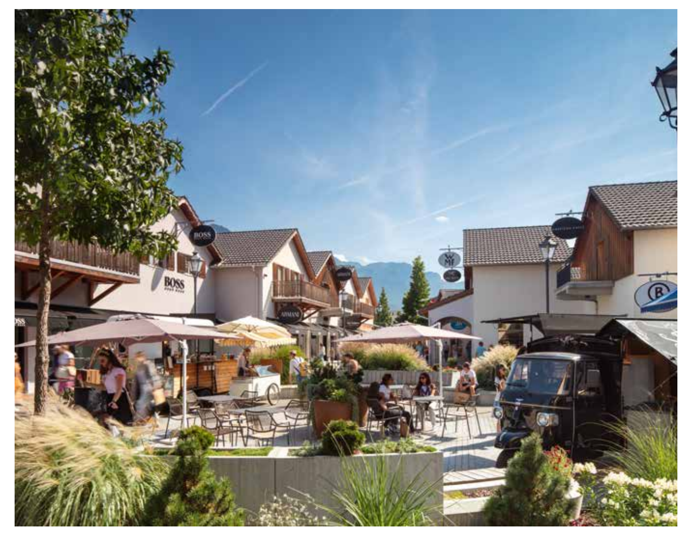
Landquart Fashion Outlet