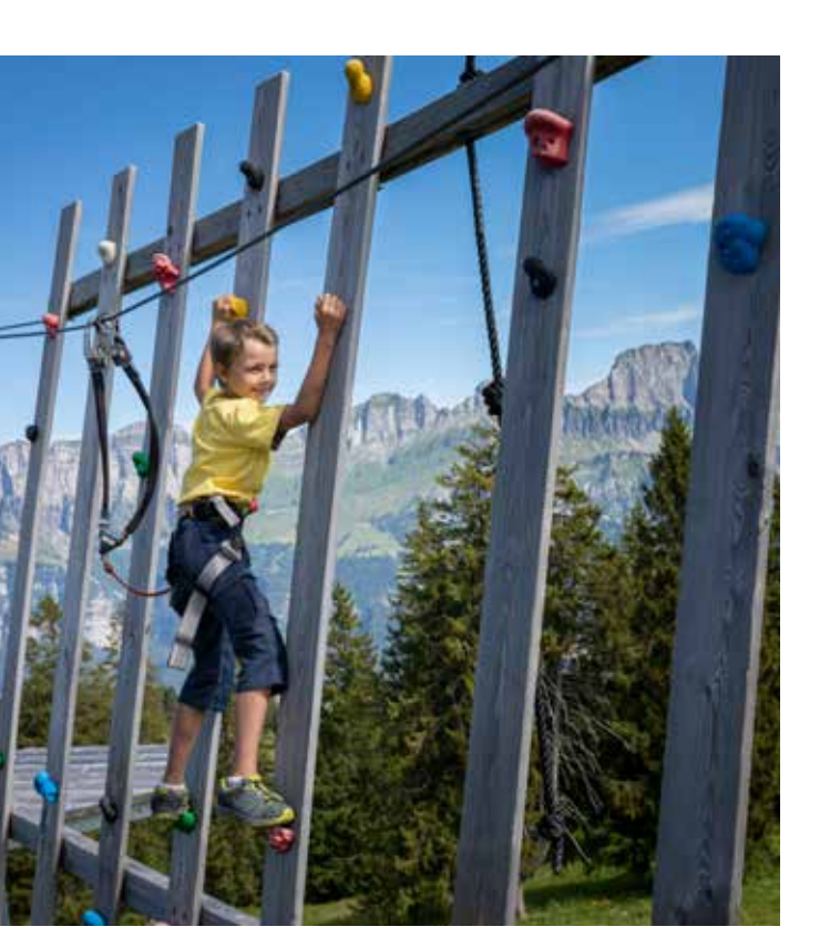
CLiiMBER, Flumserberg