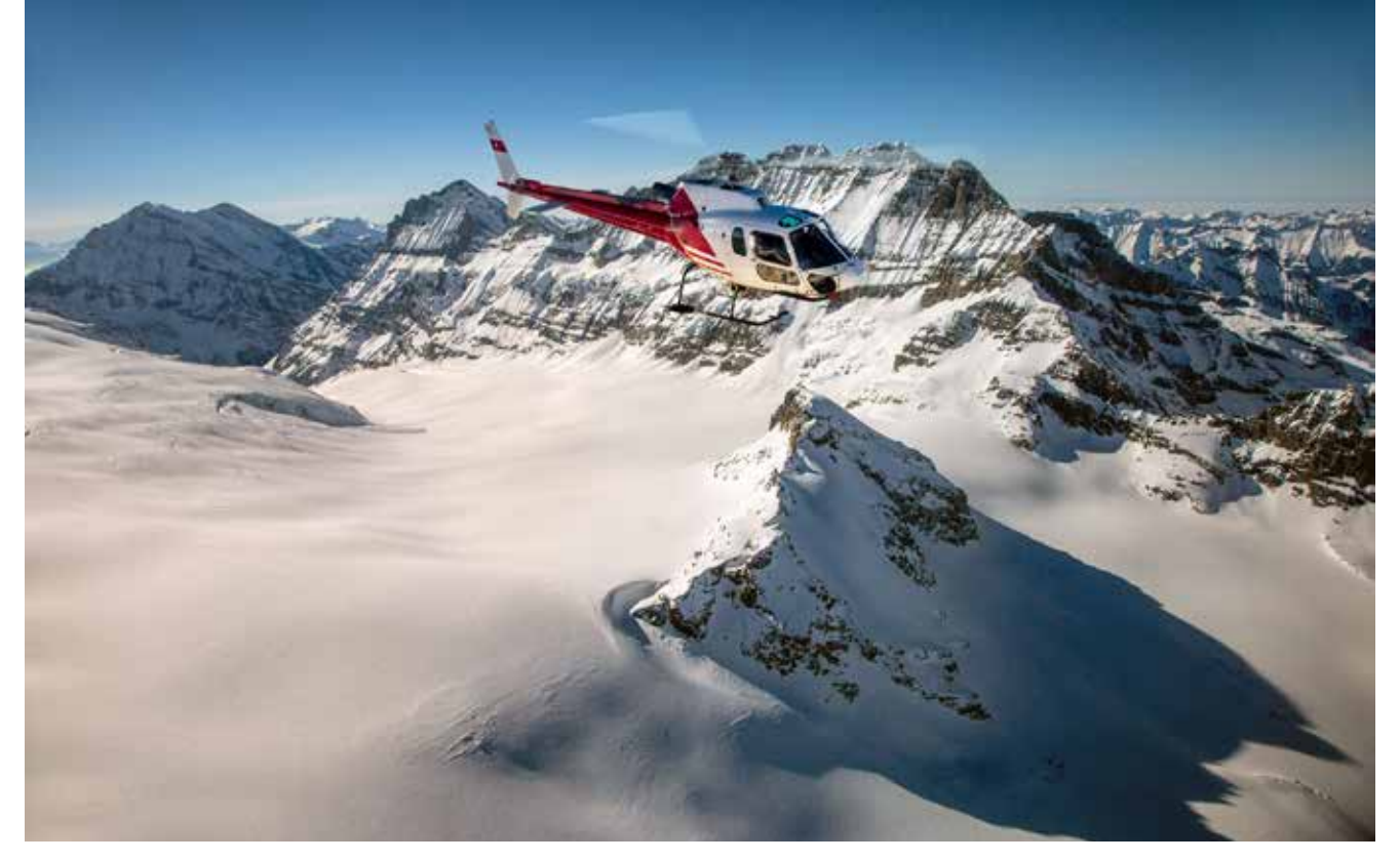
Helicopter flight, Switzerland