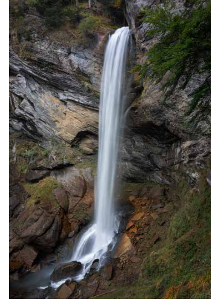
Berschner waterfall, Berschis

Distance: 20 km, 20 minutes by car from Bad Ragaz and 25 minutes footpath from the village Berschis