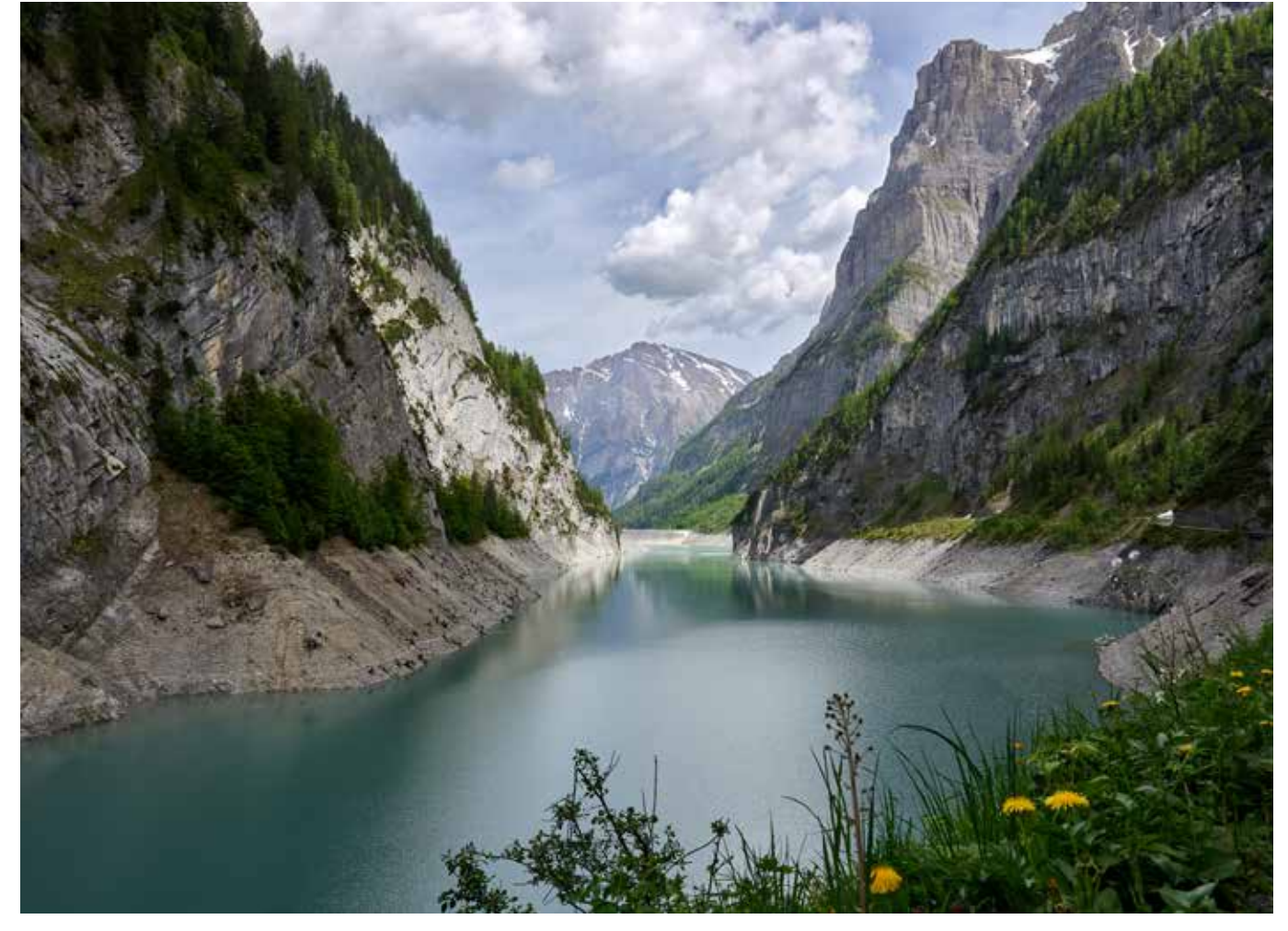
Lake Gigerwald, Vättis