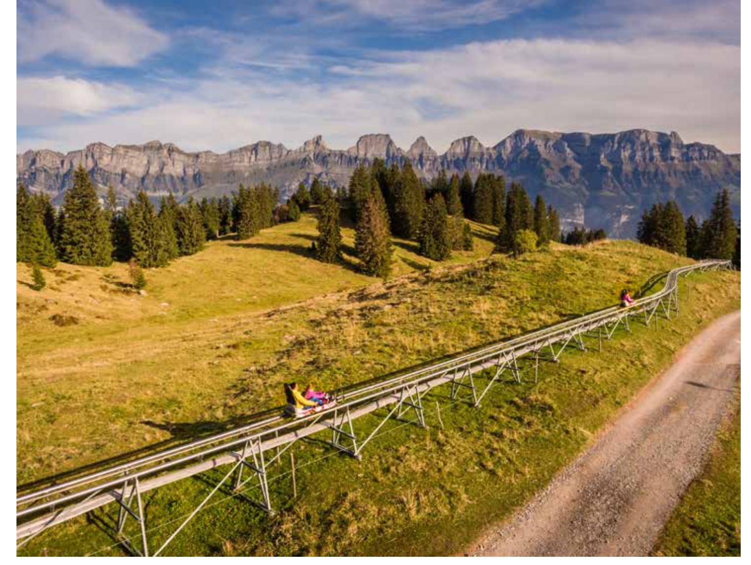
FLOOMZER, Flumserberg, © Bergbahnen Flumserberg