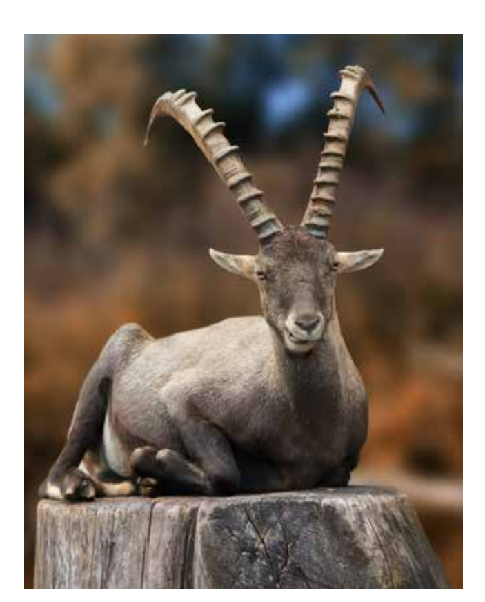
Capricorn, Feldkirch Wildlife Park