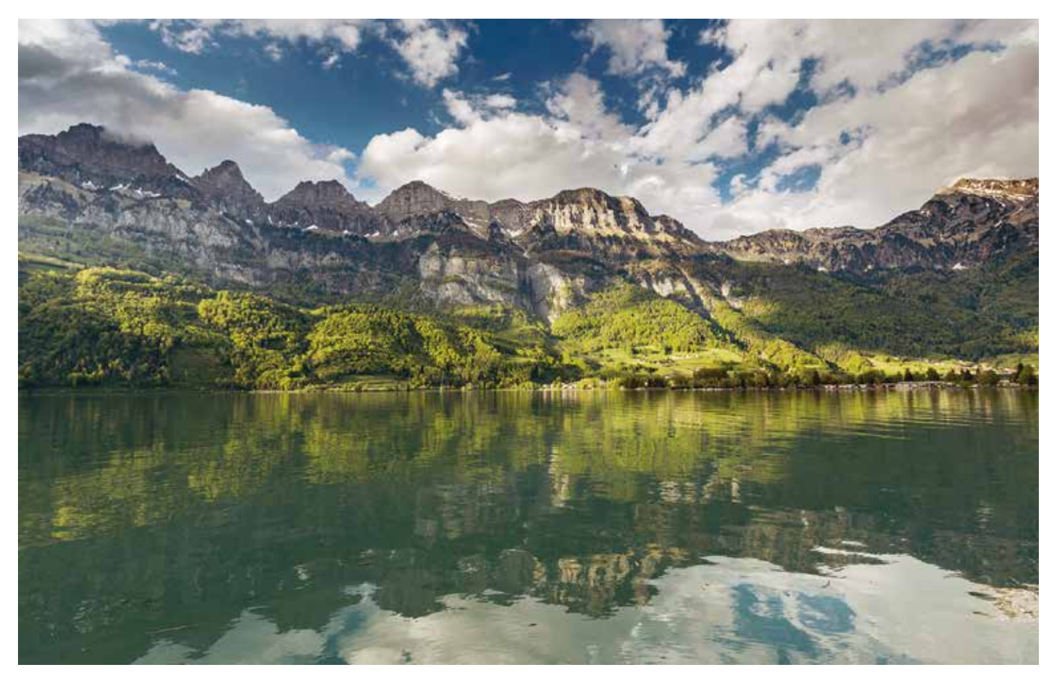
Lake Walensee, Unterterzen

Detailed information is available from our concierge