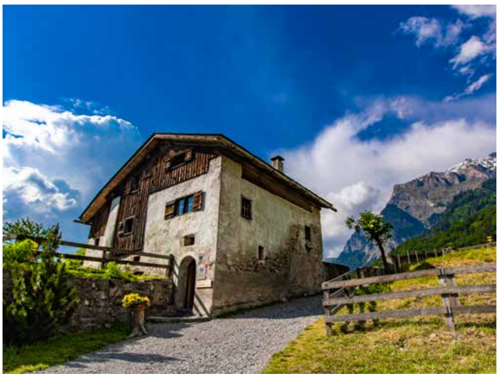
Heidi's house, Maienfeld