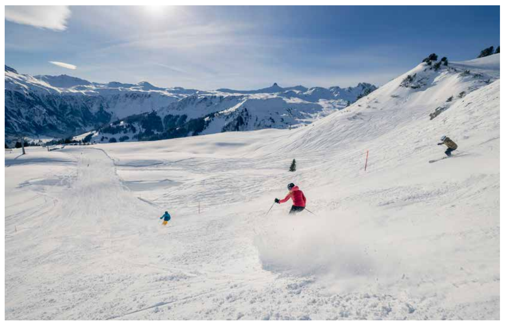
Ski slope, Flumserberg, © Bergbahnen Flumserberg AG

Our local mountain, the Pizol, offers 43 kilometers of snow fun on the slopes and is only a few minutes away from the Grand Resort Bad Ragaz. The Flumserberg winter paradise is the largest winter sports destination between Zurich and Bad Ragaz, with 65 kilometers of pistes. Other top skiing resorts are also available within a 45-minute drive, such as the Flims Laax Falera skiing destination, the Arosa Lenzerheide snow sports area and the winter sports resort of Davos.